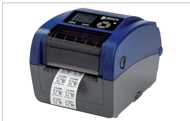
Step 3: Print