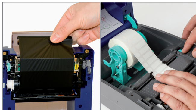
Step 1: Insert media